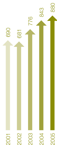
Sales Volumes (Millions of Litres) For the nine months ended September 30