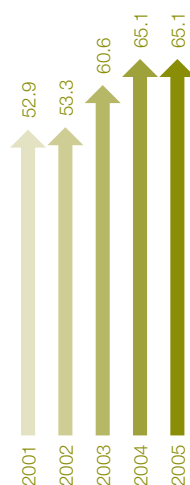
Gross Margin ($ Millions) For the nine months ended September 30